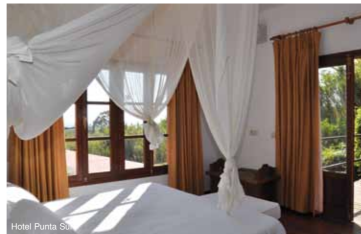
Hotel Punta Sur