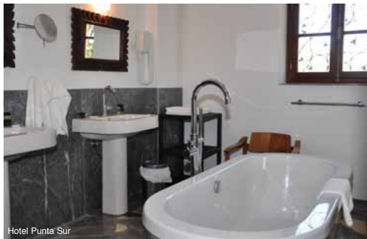
Hotel Punta Sur