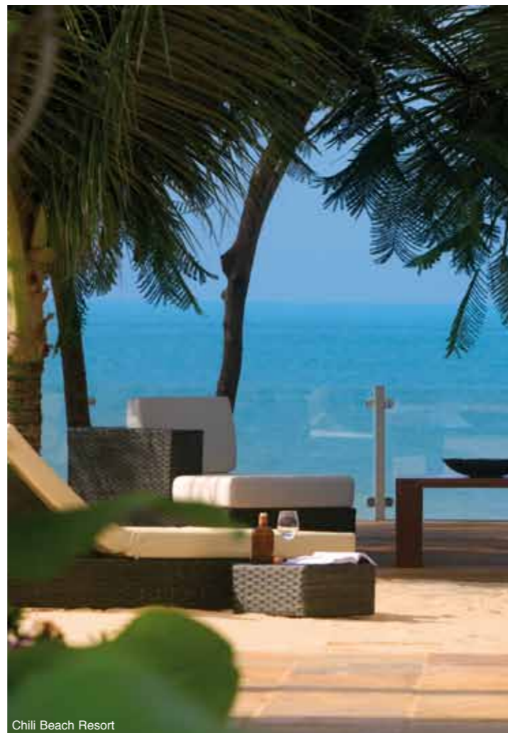
Chili Beach Resort