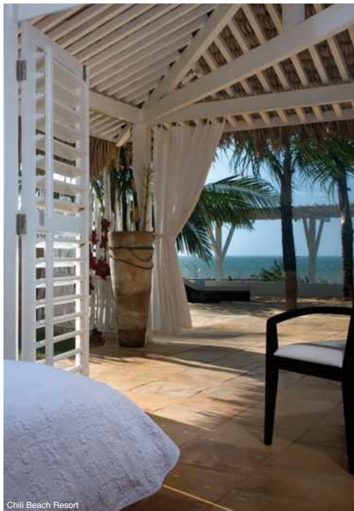
Chili Beach Resort