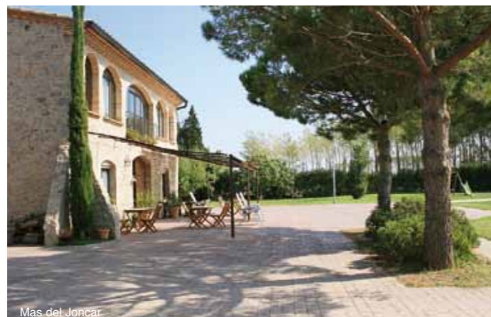
Mas del Joncar