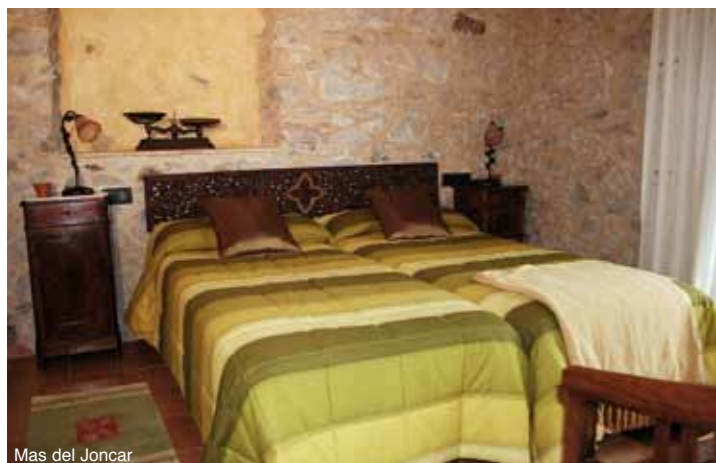
Mas del Joncar

1 week DBL/BB incl. flights from 425 EUR per person