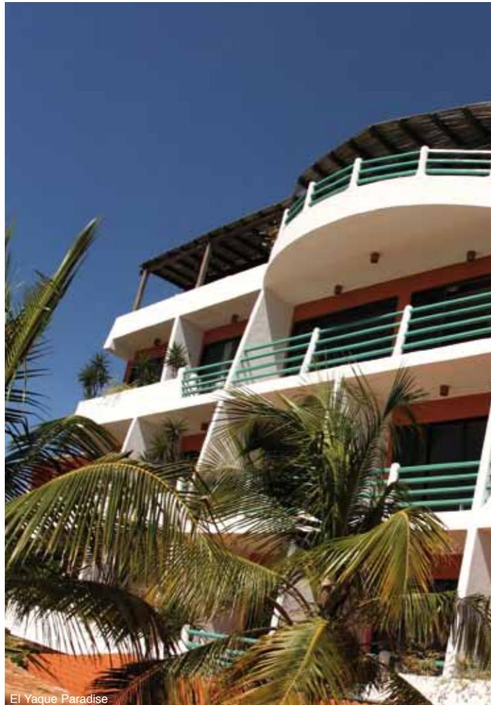
El Yaque Paradise